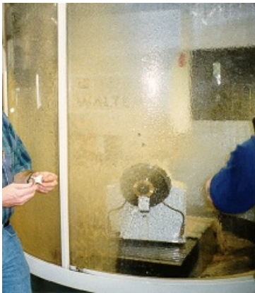
MACHINE WITH CONVENTIONAL OIL